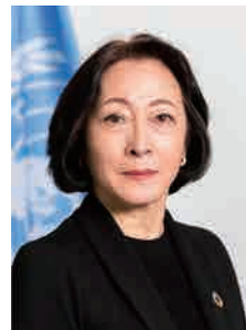
Ms. Mami MIZUTORI Special Representative of the United Nations Secretary-General (SRSG) for Disaster Risk Reduction, and Head of the United Nations Office for Disaster Risk Reduction (UNDRR)

Ms. Mizutori assumed her role on 1 March 2018. The role of the UN Office for Disaster Risk Reduction is to support countries and stakeholders in the implementation of the Sendai Framework for Disaster Risk Reduction (2015-2030). The Special Representative ensures the strategic and operational coherence between disaster risk reduction, climate change and sustainable development agendas as well as the linkage with the UN Secretary General's prevention agenda and with humanitarian action. She served in various capacities in the Japanese Ministry of Foreign Affairs. Prior to joining the UN, Ms. Mizutori was Executive Director of the Sainsbury Institute for the Study of Japanese Arts and Cultures, University of East Anglia, UK. Graduated in law from Hitotsubashi University, Tokyo and obtained a Diploma in International Studies from the Diplomatic School of Spain.