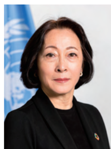
Ms. Mami MIZUTORI Special Representative of the United Nations Secretary-General (SRSG) for Disaster Risk Reduction, and Head of the United Nations Office for Disaster Risk Reduction (UNDRR)

Ms. Mizutori assumed her role on 1 March 2018. The role of the UN Office for Disaster Risk Reduction is to support countries and stakeholders in the implementation of the Sendai Framework for Disaster Risk Reduction (2015-2030). The Special Representative ensures the strategic and operational coherence between disaster risk reduction, climate change and sustainable development agendas as well as the linkage with the UN Secretary General's prevention agenda and with humanitarian action. She served in various capacities in the Japanese Ministry of Foreign Affairs. Prior to joining the UN, Ms. Mizutori was Executive Director of the Sainsbury Institute for the Study of Japanese Arts and Cultures, University of East Anglia, UK. Graduated in law from Hitotsubashi University, Tokyo and obtained a Diploma in International Studies from the Diplomatic School of Spain.