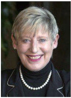
Ms. Lianne DALZIEL Former Mayor of Christchurch New Zealand

Lianne Dalziel was Mayor of Christchurch from 2013 to 2022. Prior to this, she served 23 years in the New Zealand Parliament. She was also a Cabinet Minister under former Prime Minister Helen Clark. During that time Lianne held a number of portfolios, including Immigration, Commerce, Food Safety, Women's Affairs & Senior Citizens etc. In 2012, she was invited to join the UNDRR's Parliamentary Advisory Group on Disaster Risk Reduction. During her time as Mayor, Christchurch was selected as one of the first tranche of cities to participate in the global 100 Resilient Cities Network pioneered by the Rockefeller Foundation, and was among the first group of cities around the globe to complete the initial phase of a Resilience Strategy to help safeguard the city's future against stresses and shocks.