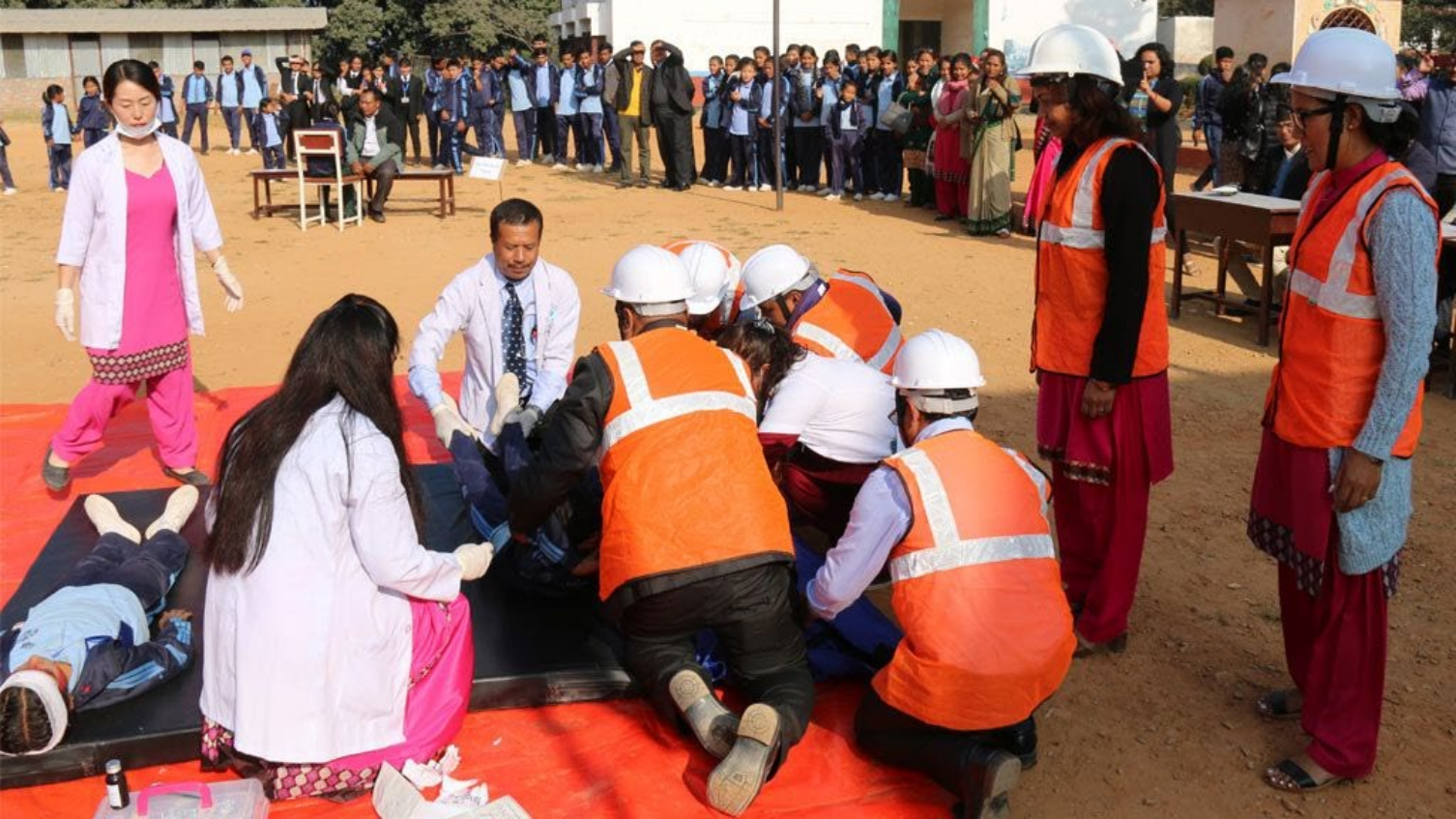
Students and teacher participate in earthquake drills at one of the 154 schools rebuilt with ADB support following the 7.8 magnitude earthquake in Nepal in 2015.